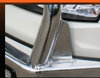
Fully Welded Gussets