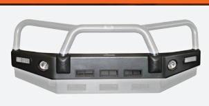
One Piece Channel